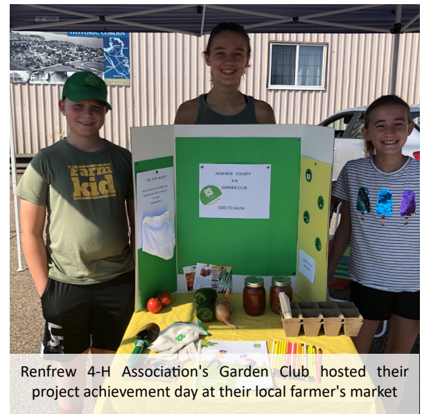
Renfrew 4-H Association's Garden Club hosted their project achievement day at their local farmer's market