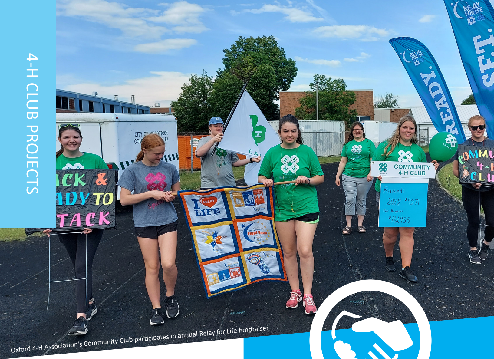
Oxford 4-H Association's Community Club participates in annual Relay for Life fundraiser