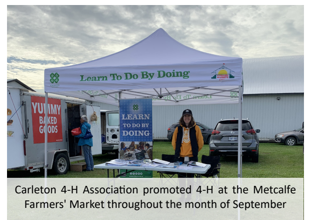
Carleton 4-H Association promoted 4-H at the Metcalfe Farmers' Market throughout the month of September