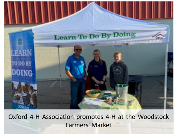
Oxford 4-H Association promotes 4-H at the Woodstock Farmers' Market