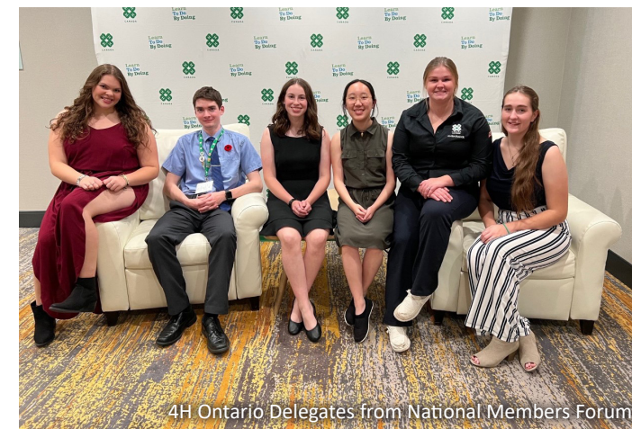
4H Ontario Delegates from National Members Forum