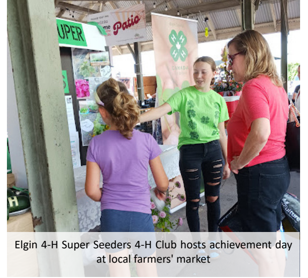
Elgin 4-H Super Seeders 4-H Club hosts achievement day at local farmers' market

Scan the QR code to access the 2023 Farmers' Markets Ontario Interest form.