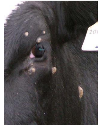
Warts around a calf's eye