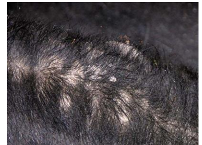
Warts on the tail head of a calf – an unusual location

Impact: visible indication of infection, unsightly to public