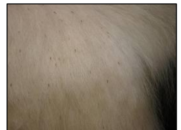
Lice on the skin of a calf